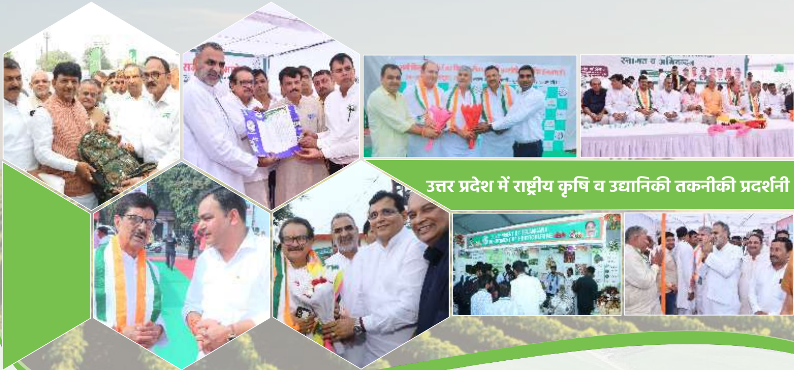
उत्तर प्रदेश में राष्ट्रीय कृषि व उद्यानिकी तकनीकी प्रदर्शनी

"Center of Attention" of the Agri & Horti - Technology Exhibition